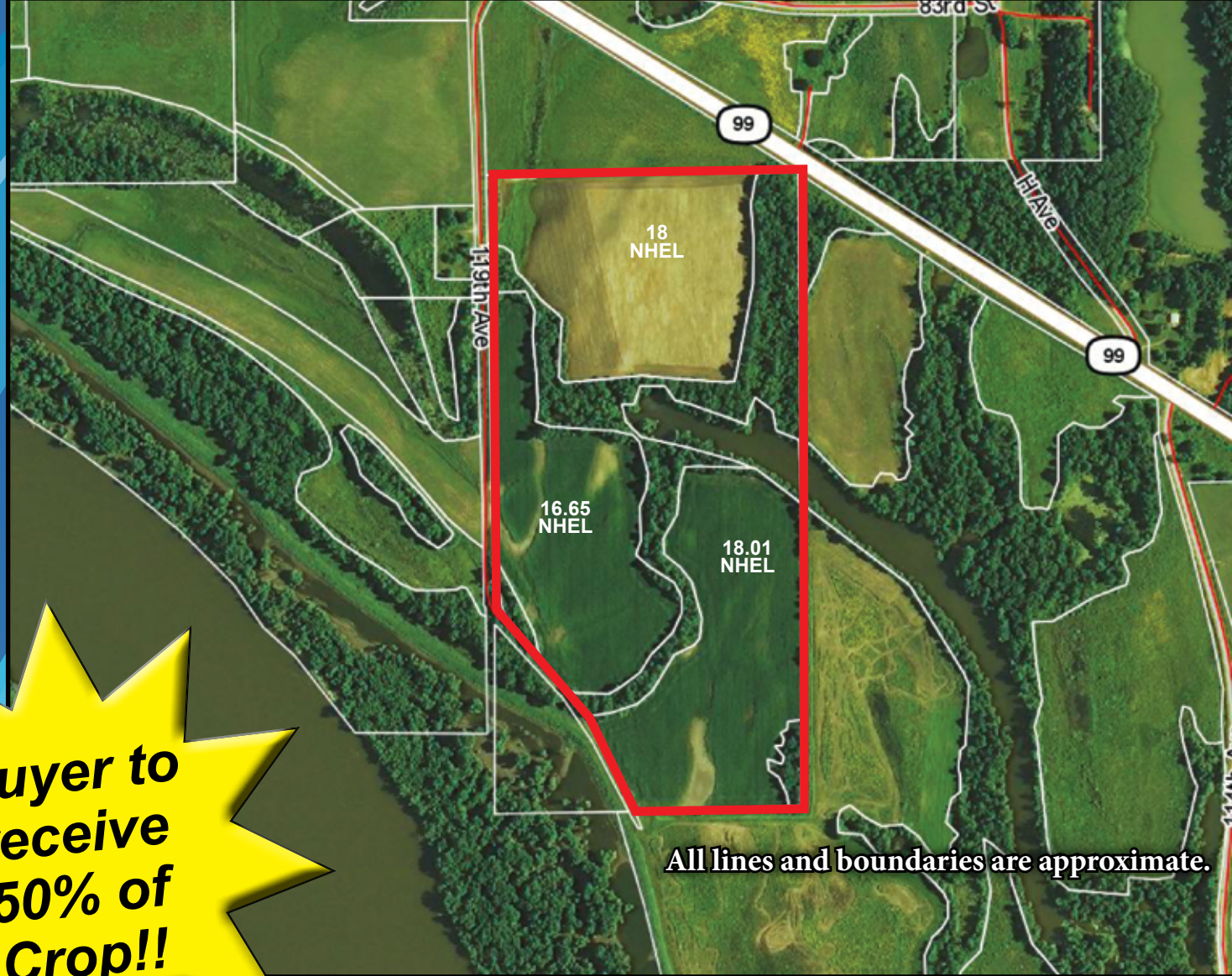
All lines and boundaries are approximate.

WAPELLO, IOWA Land is located 1 mile east of Wapello, Iowa on Highway 99, then ¼ mile south on 119th Avenue. Auction will be held at the Charles W. Briggs Civic Center, 317 Water St., Wapello, Iowa. 72.9 Taxable Acres Sells in One Tract | Tillable Ground & Timber Ground FSA information: 52.66 acres tillable, balance being timber & pond. Corn Suitability Rating 2 on the tillable of 47.6 (CSR 1 of 61.2). Corn Suitability Rating 2 on the entire farm of 44.3 (CSR 1 of 57). Located in Section 36, Jefferson Township, Louisa County, Iowa. Not included: Farm Machinery